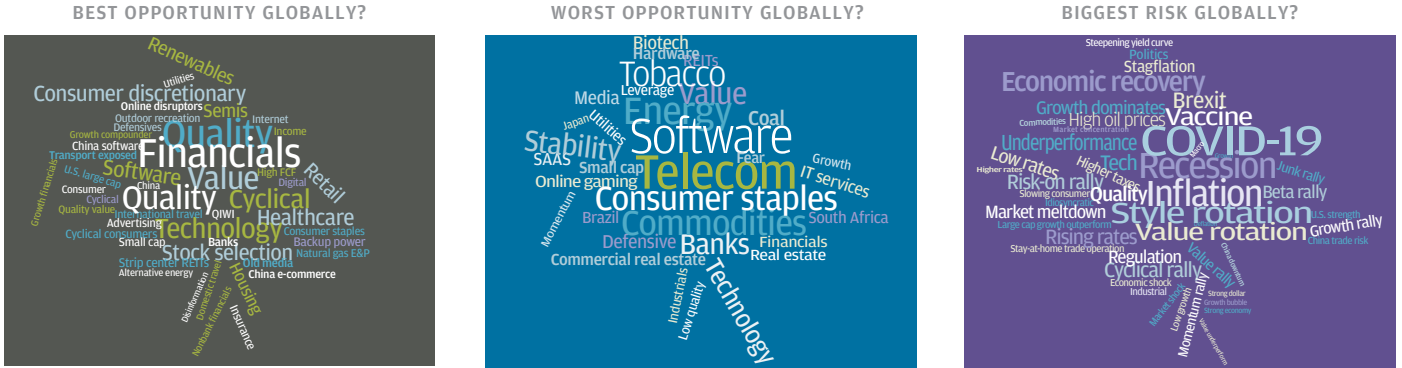
A subset of results is shown for an October 2020 survey of Global Equity Investors Quarterly participants. These responses are taken from a quarterly survey representing 41 CIOs and portfolio managers across Global Equities.