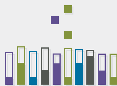
The result is a suite of equity ETFs designed to capture market upside with less volatility and, therefore, improve risk-adjusted returns.