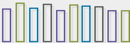
In J.P. Morgan's approach to strategic beta, sector and region weights are adjusted to distribute risk more evenly.